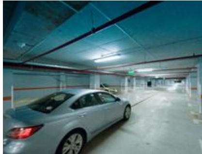
Monitoring in underground garages (safety)