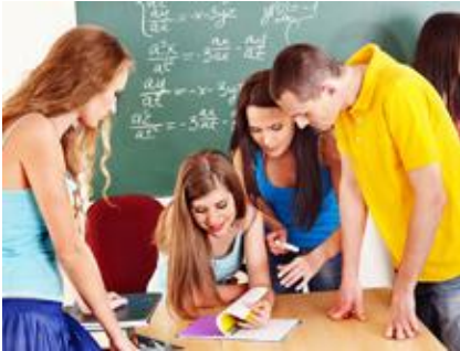
Indoor air quality