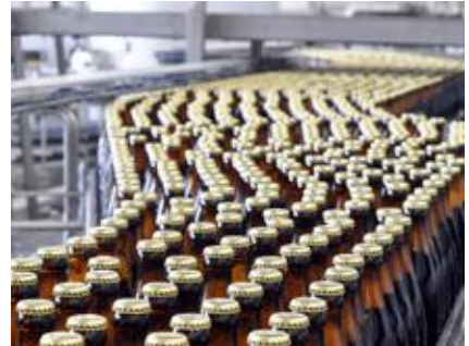
Leak monitoring in filling plants (safety)