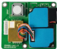
Fig 1: CH20 version